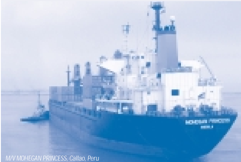
M/V MOHEGAN PRINCESS, Callao, Peru