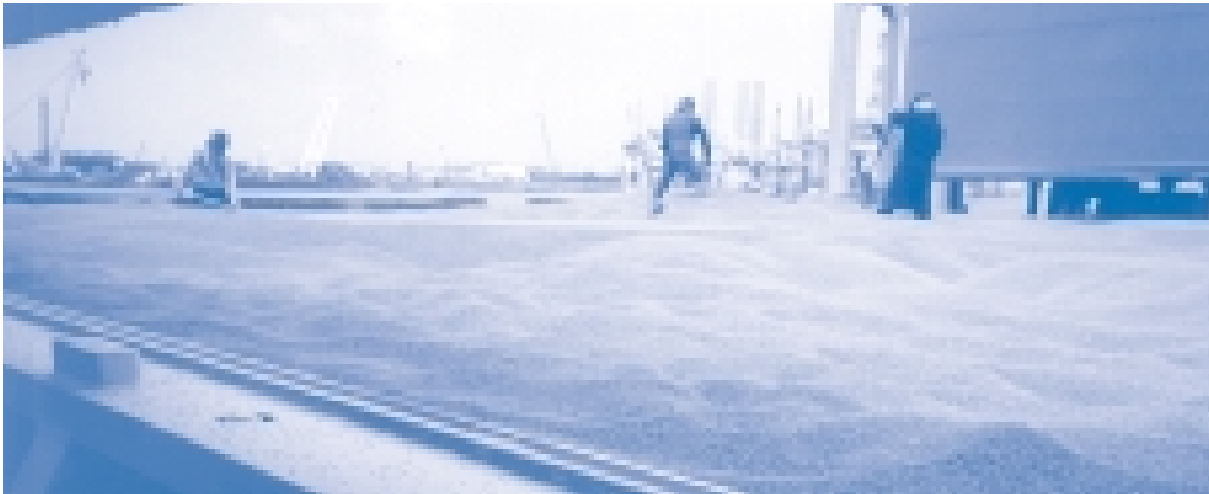
Final trimming of wheat destined for Nigeria.

In addition, TBS will be transporting other major bulk commodities to Nigeria including salt, sugar and cement.