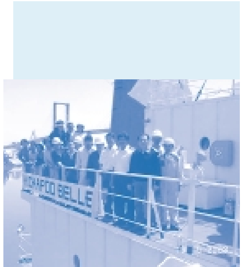
Officers & crew of the M/V KICKAPOO BELLE involved in the rescue operation in the Atlantic Ocean.