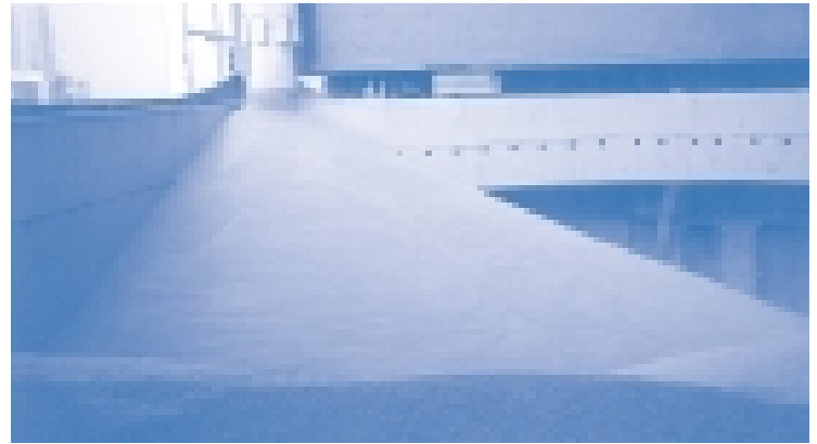
Using terminal pneumatic chutes, 26,330 tons of bulk wheat is poured into the 5 holds of the M/V AURORAL ACE in Galveston, Texas, May, 2003.

Recently, TBS made a policy decision to get involved in Nigeria's ocean transportation needs for bulk commodities. In March of this year, TBS signed its first contract with one of Nigeria's major industri-