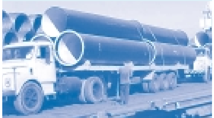
Up to 40' long and 4' in diameter, the Saint-Gobain steel pipe is delivered dockside in Rio de Janeiro for loading by TBS.